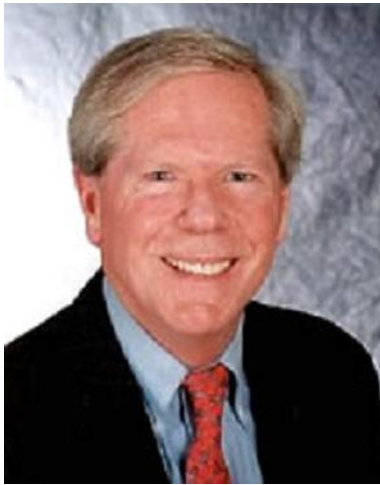
Paul Craig Roberts, PhD

December 4, 2007 – Eight former senior Republican administration appointees have severely criticized the official account of 9/11 and several have called for a new investigation. "I find the facts against the official story of the [WTC] buildings' collapse more compelling than the case that has been made in behalf of the official story. I would like to see the issue debated by independent scientists and engineers," wrote Paul Craig Roberts, PhD, Assistant Secretary of the Treasury under President Ronald Reagan. "A real investigation is needed to find an explanation consistent with the evidence, even if it doesn't reassure the public," said Dr. Roberts 1 , frequently referred to as the "Father of Reagonomics."