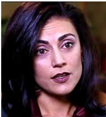
Sibel D. Edmonds