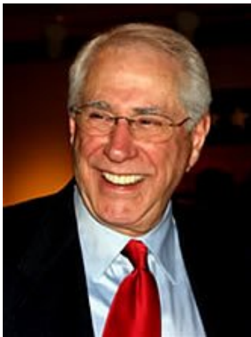
Senator Mike Gravel