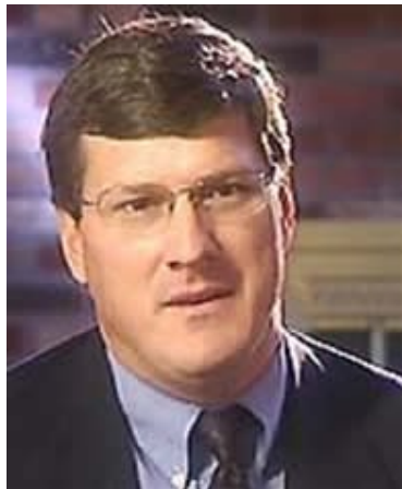
Maj. Scott Ritter